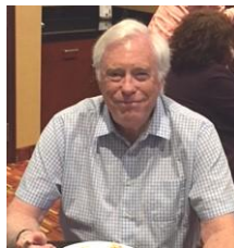
Circle of Service